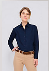
SOL'S EXECUTIVE 16060