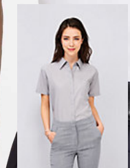
SOL'S ESCAPE 16070