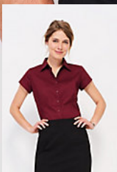
SOL'S EXCESS 17020