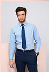
SOL'S BRIGHTON 17000