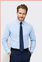
SOL'S BOSTON 16000