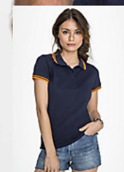
SOL'S PASADENA WOMEN 00578