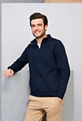
SOL'S SUNDÆ 47200